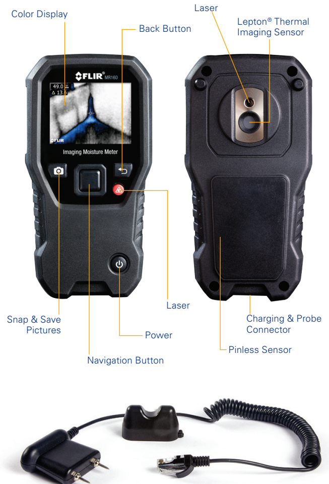
MR02 Pin Probe included

PORTLAND Corporate Headquarters FLIR Systems, Inc. 27700 SW Parkway Ave. Wilsonville, OR 97070 USA PH: +1 866.477.3687