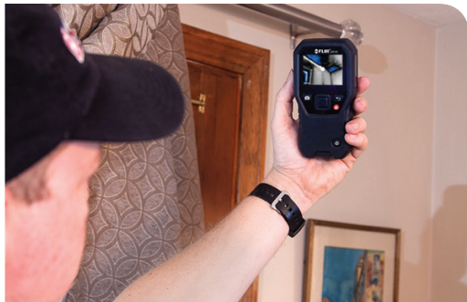
Scanning ceiling & wall joint for moisture issues