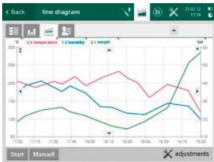
Display of measured values as a line graph