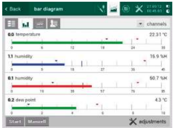
Display of measured values as a bar chart