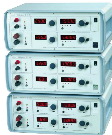
C233C three phase asymmetrical source up to 20A C233BC three phase asymmetrical source up to 100A