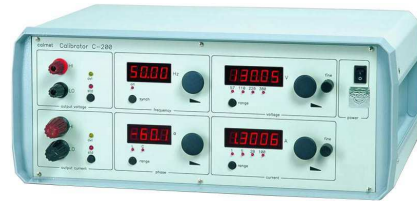
C200 single phase source up to 20A C200B single phase source up to 100A

Series C200 Calibrators has been built in standard 19" aluminium case. The C233 Calibrator is constructed in three cases and consists of one calibrator basic configuration (phase L1) and two calibrators in special configuration (phase L2 and phase L3).