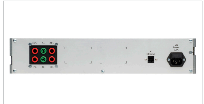
Insulation tester IS 1885L Plug-in 19" / 2 HU